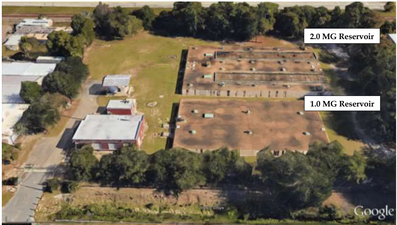
Figure 1: Aerial View of the Lakeshore WTP

The Lakeshore Water Plant is located at 2113 Hamilton Street. The water plant was constructed in the early 1950's. The plant includes source water wells, ground storage reservoirs with fans primarily for hydrogen sulfide removal, sodium hypochlorite system for disinfection and high service pumps for conveying treated water to the distribution system (Figures 1 & 2).