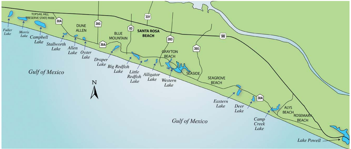
Figure 1 Florida Panhandle Coastal Dune Lakes