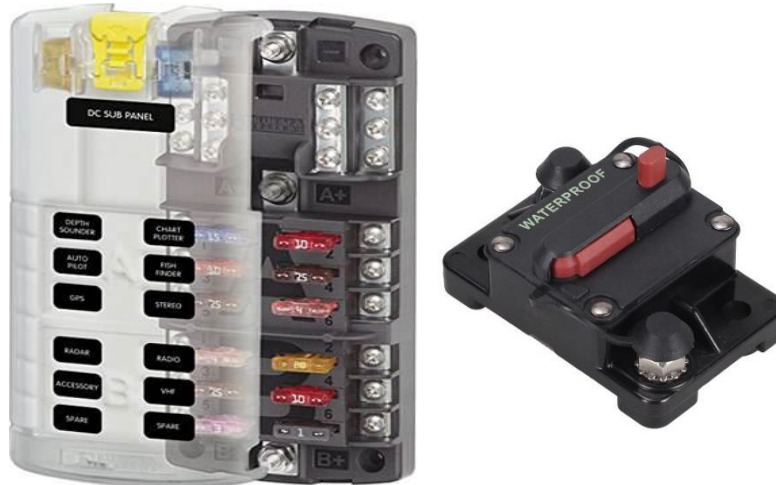
Blue Sea Systems ST Blade ATO/ATC Fuse Blocks Style Name: 12-Circ Split w/Cover & Neg